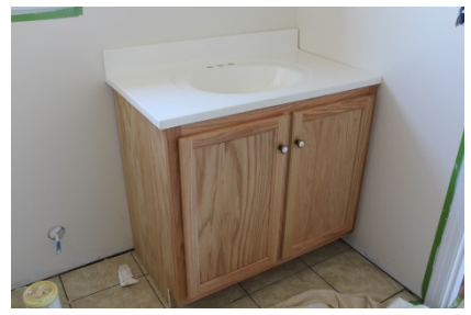
Again, many thanks to the Guild Instructors and mentors for being so generous with your time and talent in bringing fledgling woodworkers along into the world of cabinetry!